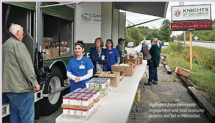
Highlights from community engagement and food insecurity projects last fall in Millinocket.

Supporting Maine’s older people in their communities continues to be a strategic priority for MeHAF. Thrive Penobscot’s network exemplifies the possibilities that emerge when a community comes together and applies a spirit of ingenuity to achieving this goal.