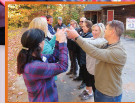
HLD classmates take part in the yearly Outward Bound weekend in Western Maine.