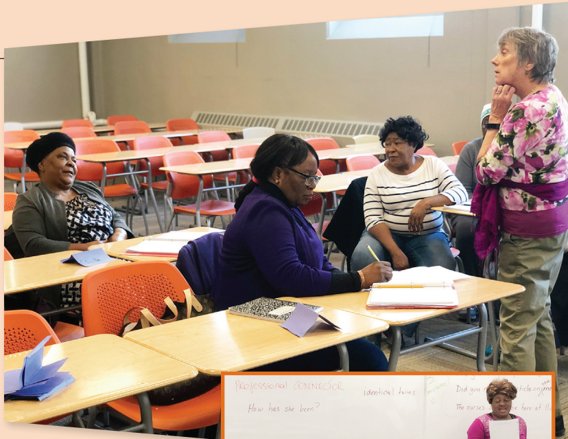
A Saturday Find Your Voice class where women participate in an immersive educational environment to gain stronger language skills.

"Heal Your Body" is one of IHP's many programs that empower women to become strong, informed advocates for both themselves and their families. In Her Presence reflects an inspiring trend of immigrant women's leadership in Maine and shows the benefits of tying together multiple cultural experiences for the benefit of everyone.